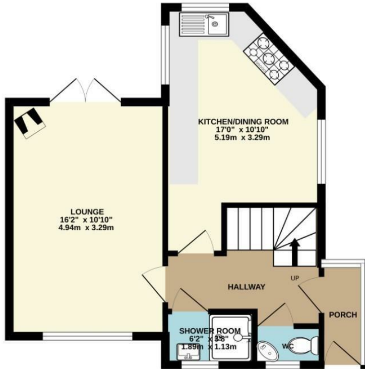
GROUND FLOOR 446 sq.ft. (41.4 sq.m.) approx.